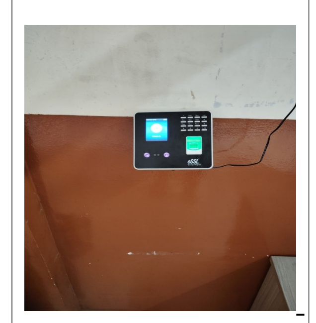
Toilet of Ladies