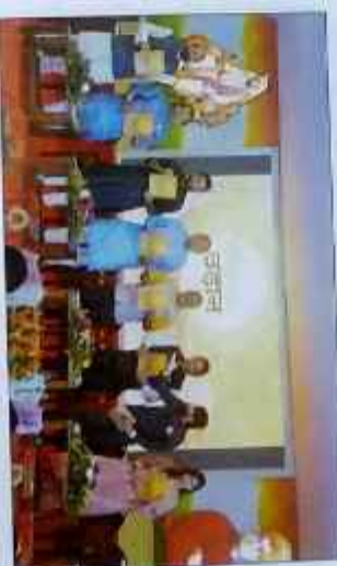
"Udian" Ignorance Ceremony