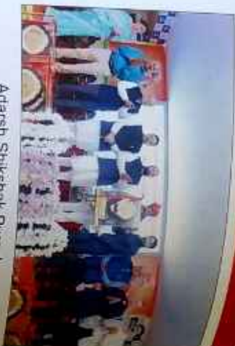
Adarsh Shikshak Puraskar