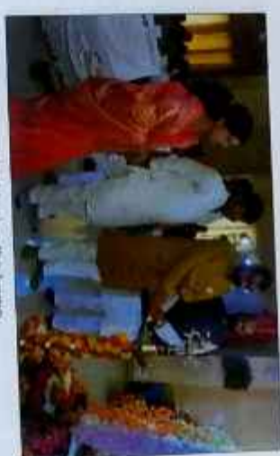
Lightening the Lamp