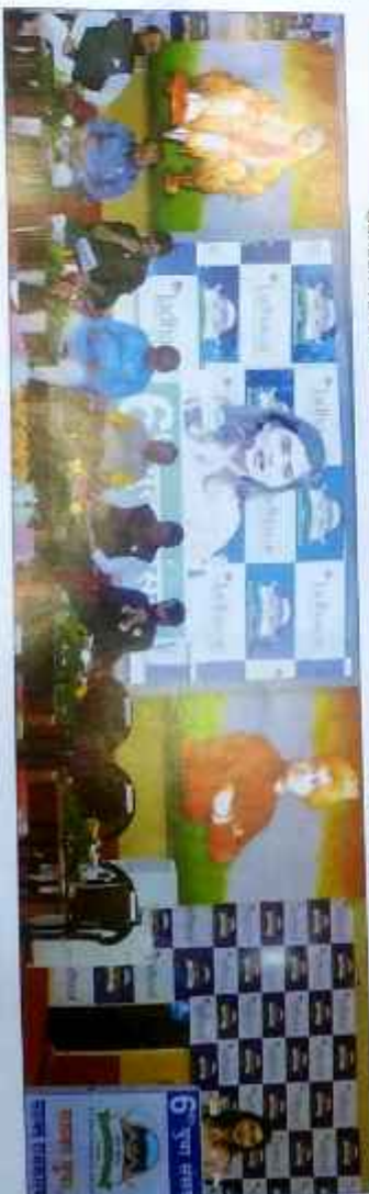
6th Yuva Sansad - Dignitaries on the Dais