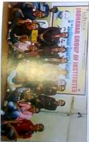
5th Jadhavar Sports Festival