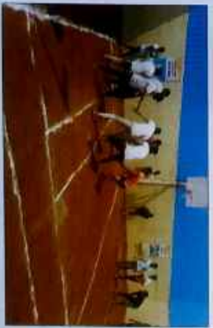
5th Jadhavar Sports Festival